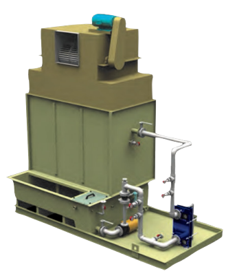
Liquid desiccant packaged conditioner

Alfa Laval reserves the right to change specifications without prior notification.